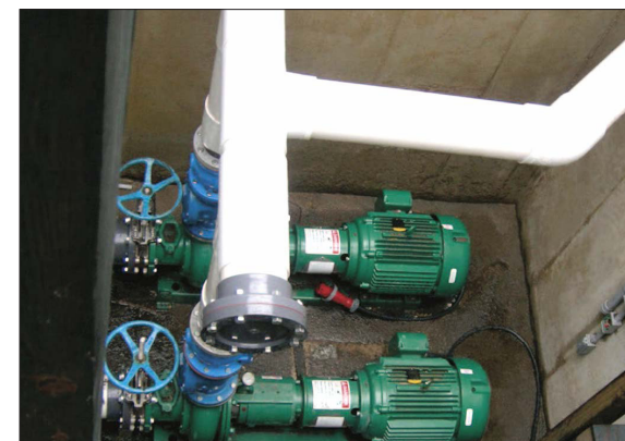
Two Vaughan Effluent Pumps from digester to solids separator.