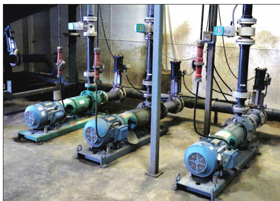
Vaughan Influent Pumps to heat exchanger and the digester.