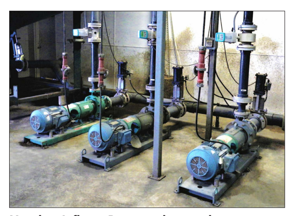
Vaughan Influent Pumps to heat exchanger and the digester.