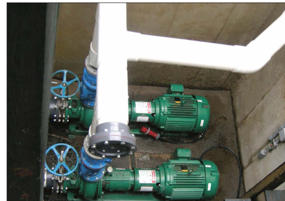
Two Vaughan Effluent Pumps from digester to solids separator.